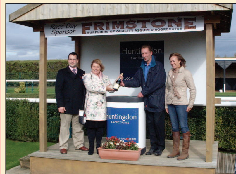
RACE DAY - at Huntingdon